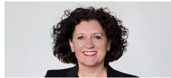
Annemie TURTELBOOM Belgium