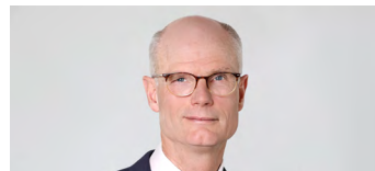
Stef BLOK Netherlands